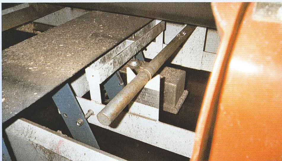
THAYER belt scales make use of small, bar-stock calibrating weights instead of heavy test weights, chains, or dummy signals.