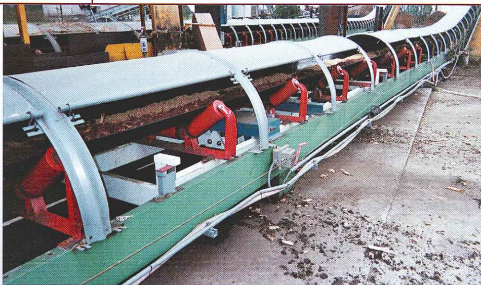
One of two conveyors with THAYER RF (rocking-fixture) belt scales.

Riverwood's paperboard mill in West Monroe, Louisiana, uses wood chips from an adjacent wood yard operated by West Monroe Fibre Processing, Inc. (WMF). The spelling of "Fibre" is French, which is appropriate to Louisiana's heritage and also reflects the name of WMF's mother company, Georgia-based Fulghum Fibres, Inc., which owns 18 such facilities under contract to paper mills throughout the South.