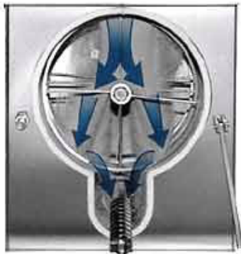
“U” Trough with Power Bar

The PFM-18L-S is designed for fast, easy and thorough clean out. Feeder completely disassembles in less than one minute. High quality, rugged, stainless steel construction assures years of reliable, trouble free operation even in the most severe industrial environments.